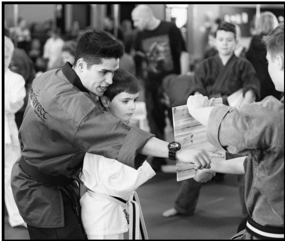
"Action expresses priorities." — Ghandi